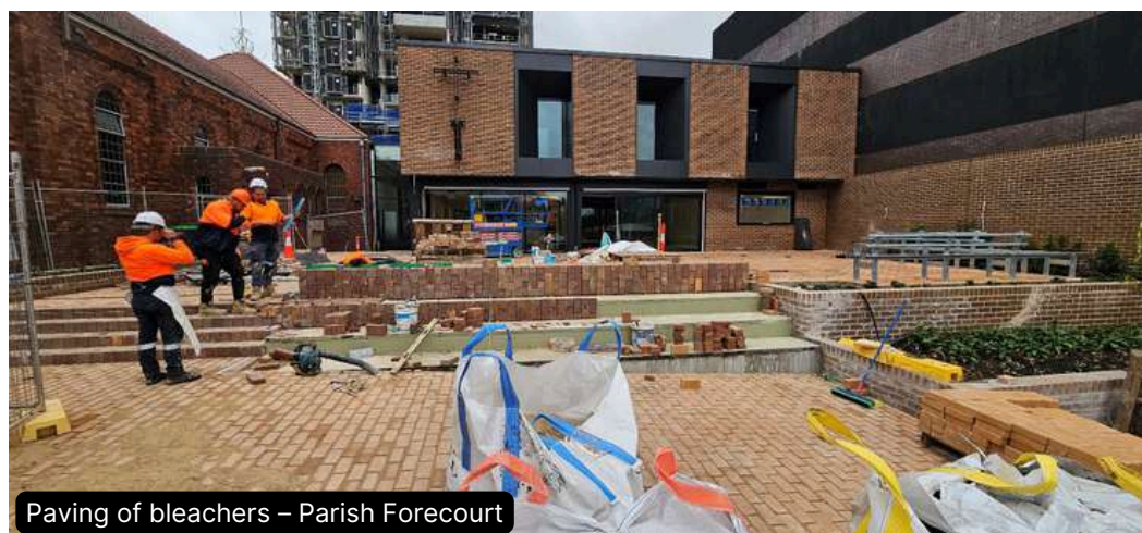
Paving of bleachers - Parish Forecourt