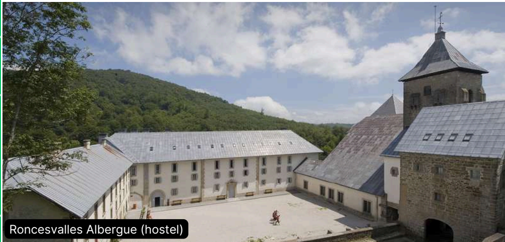
Roncesvalles Albergue (hostel)

1 SEPTEMBER 2024 TWENTY-SECOND SUNDAY IN ORDINARY TIME